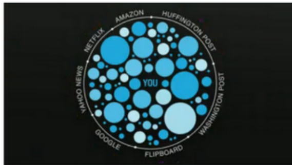
The effect of the "filter bubble" that homogenizes what we see.